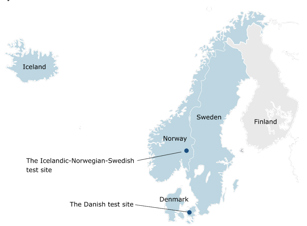
Figure 1. Locations of the test sites. (Image: Modified from Hayden120, CC BY-SA 3.0, https://commons.wikimedia.org/w/index.php?curid=10455785).

The reason for having two test sites is the differences between Norway, Sweden and Iceland (and Finland) on one hand, and Denmark on the other hand, with respect to climate and the use of studded tyres. See also Section 7.1.