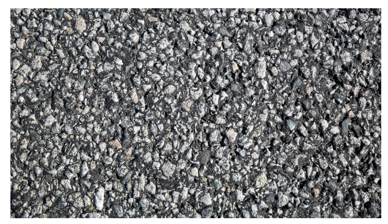
Figure 3. The road surface on the Icelandic-Norwegian-Swedish test site.