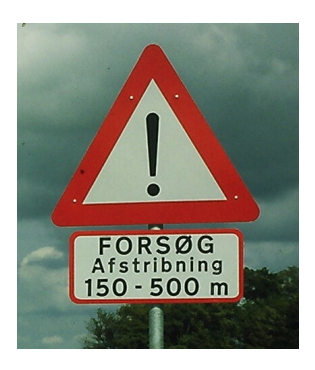
Figure 4. Warning sign.

Warning signs with subpanels inform drivers about the test site, Figure 4.