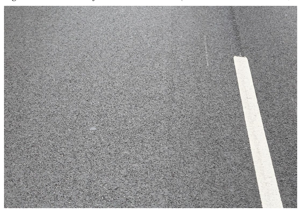
Figure 6. The road surface on the Danish test site.