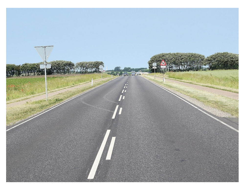
Figure 5. The road used for the Danish test site. (Photo: Trond Cato Johansen, Ramböll).